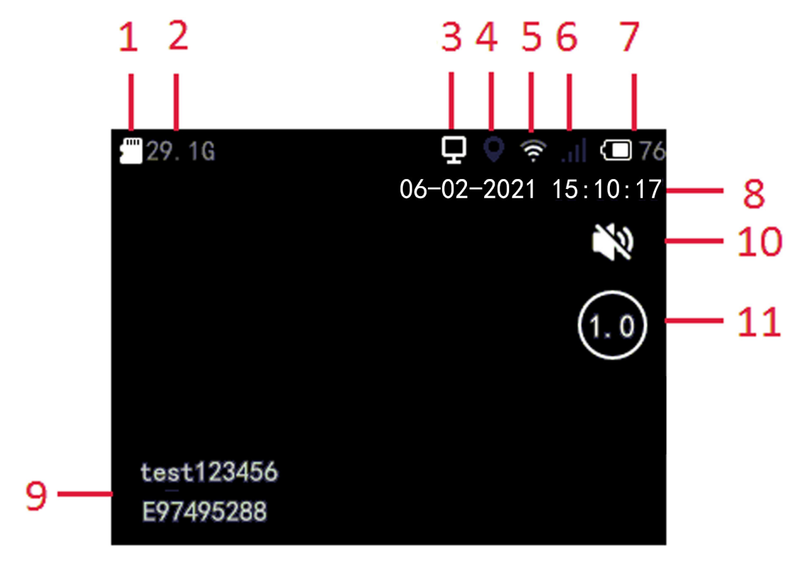
Figure 2-2 Startup Page